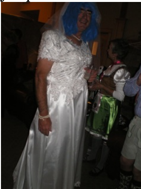
Rich and Rich...ummm